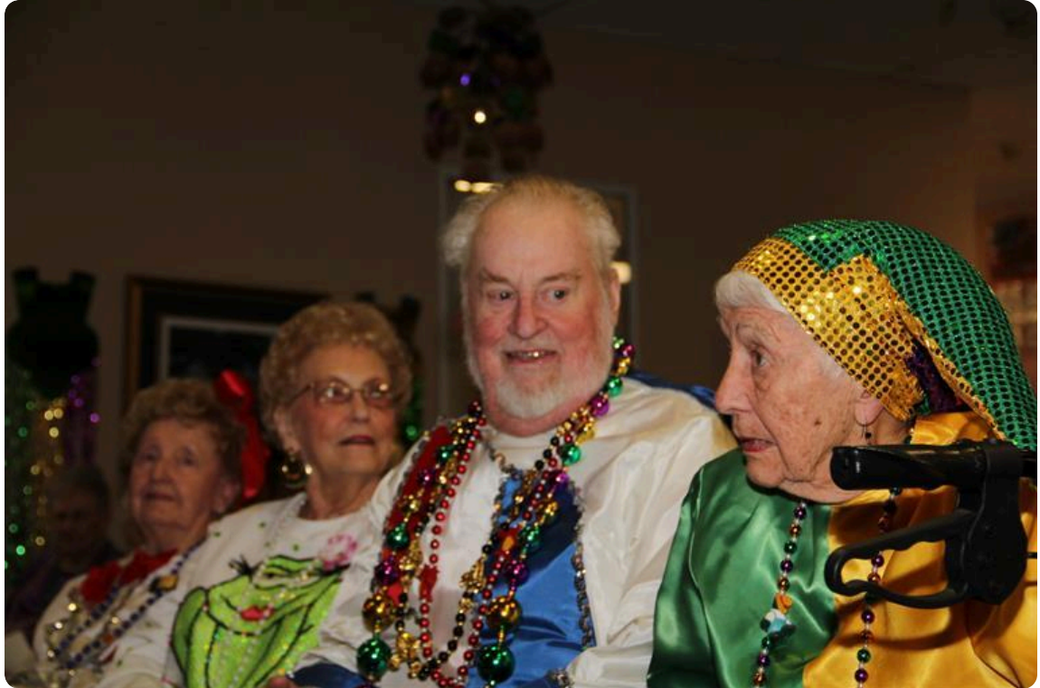
Windsor Mardi Gras Court 2014